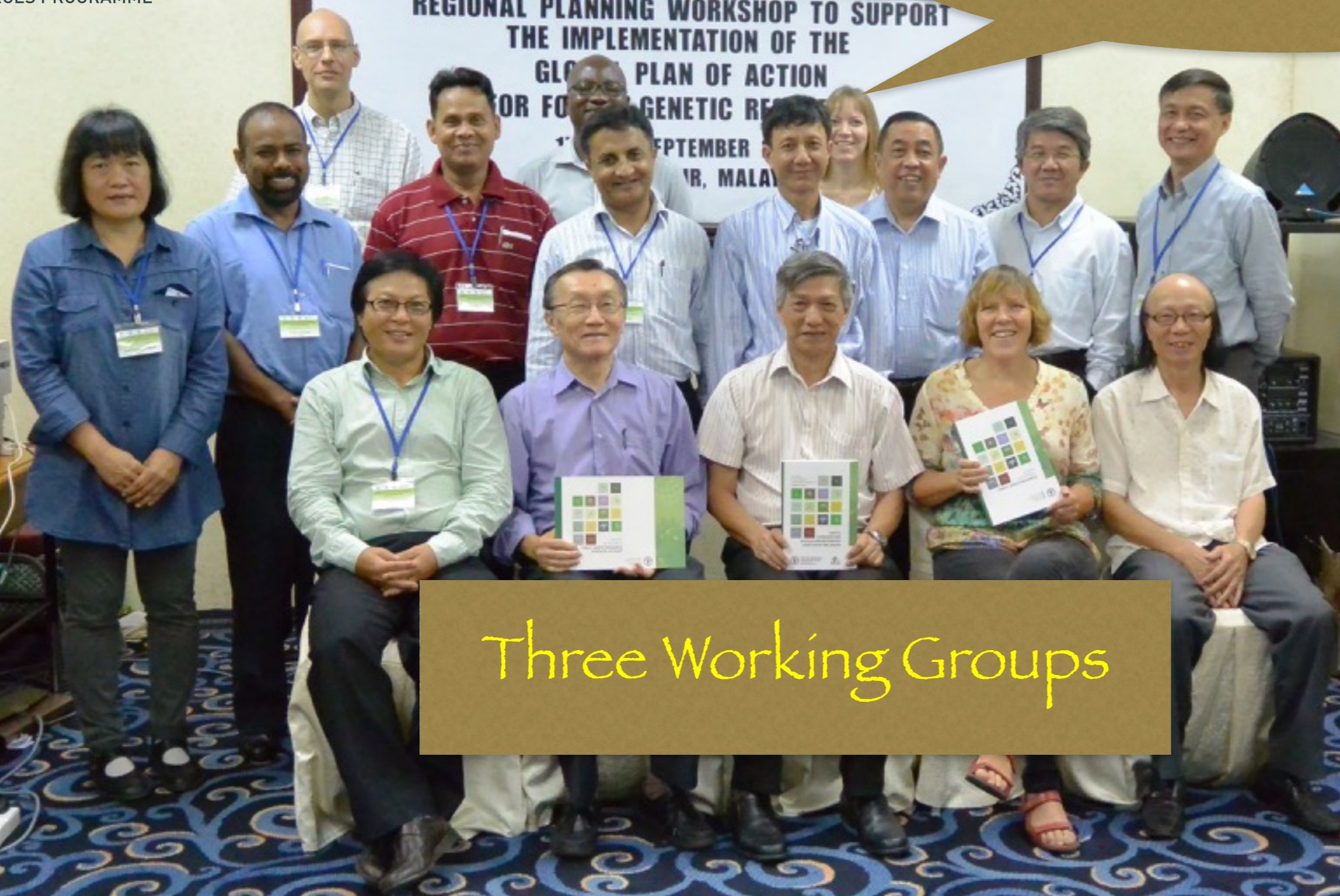
Three Working Groups