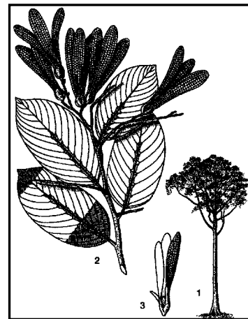
1: tree habit; 2: fruiting twig; 3: fruit. From: Plant Resources of South East Asia 5:1

Description: The trees are readily recognized from a distance by the coppery crown, due to yellow-brown or grey-brown tomentose on the underside of the leaves. A large tree can reach up to 60 m in height and 175 cm in diameter. Buttresses can reach to 1.5 m in height and are spreading and concave. The crown tends to shape as an umbrella, wide-spreading with horizontal branches and persistent leader. The first bole branch can be found as high