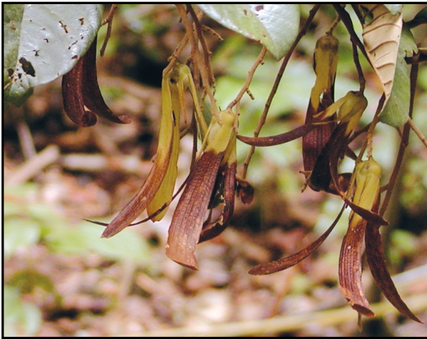
Fruiting twig: from the fruiting season of dipterocarps year 2000 in Pasoh Forest Reserve, Malaysia.

initiated in Malaysia and Indonesia but are still in the infant stage. An International Tropical Timber Organization (ITTO) project has been initiated in Indonesia to increase the genetic diversity of S. leprosula for breeding and genetic improvement. Provenance trials using half-sib families of selected plus trees of S. leprosula have been reported in Peninsular Malaysia.