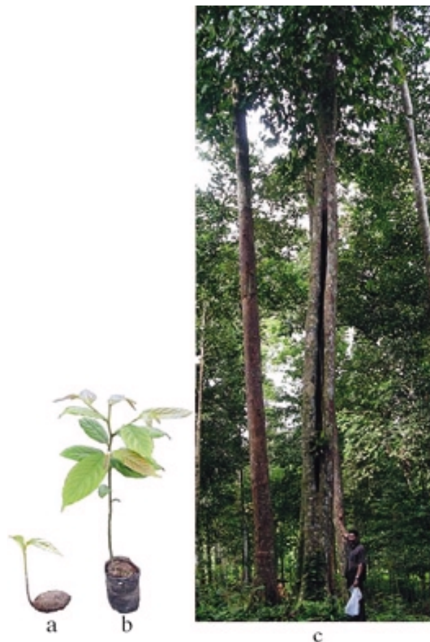
Fig. 2 Profile of E. zwageri tree a: 2-month old seedling b: 5-month old seedling c: old tree in natural distribution, Central Kalimantan

Flowering can occur even throughout the year depending on location and climate. The flowers burst in August–November in Palembang; in July in