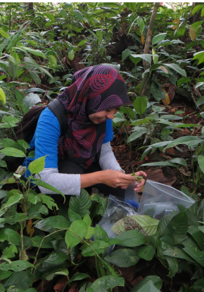
Photo: Collecting samples for genetic studies

ssp. hemsleyana , S. peltata , S. roxburghii , S. stenoptera and S. teysmanniana . Yet, the actual conservation status of many of the species is uncertain at the lack of up-to-date information on their distribution and population status.