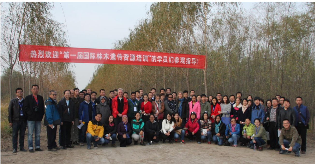
Photo: Second Regional Training Course on forest genetic resources, Binzhou, China – Credit: China Happy Ecology Ltd.