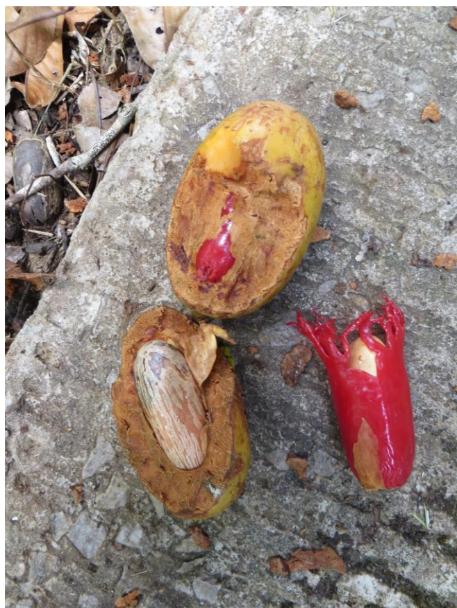
Photo: Fruits and seed of Myristica (wild nutmeg), Niah National Park, Sarawak, Malaysia

APFORGEN, established in 2003, is the only network in Asia and the Pacific that focuses on the conservation and sustainable use of forest genetic resources. APFORGEN's broad membership and long-term experience in developing and implementing collaborative research and capacity development initiatives make it ideally placed for coordinating the implementation of the Global Plan of Action in the region in close collaboration with FAO and other relevant national, regional and international organizations.