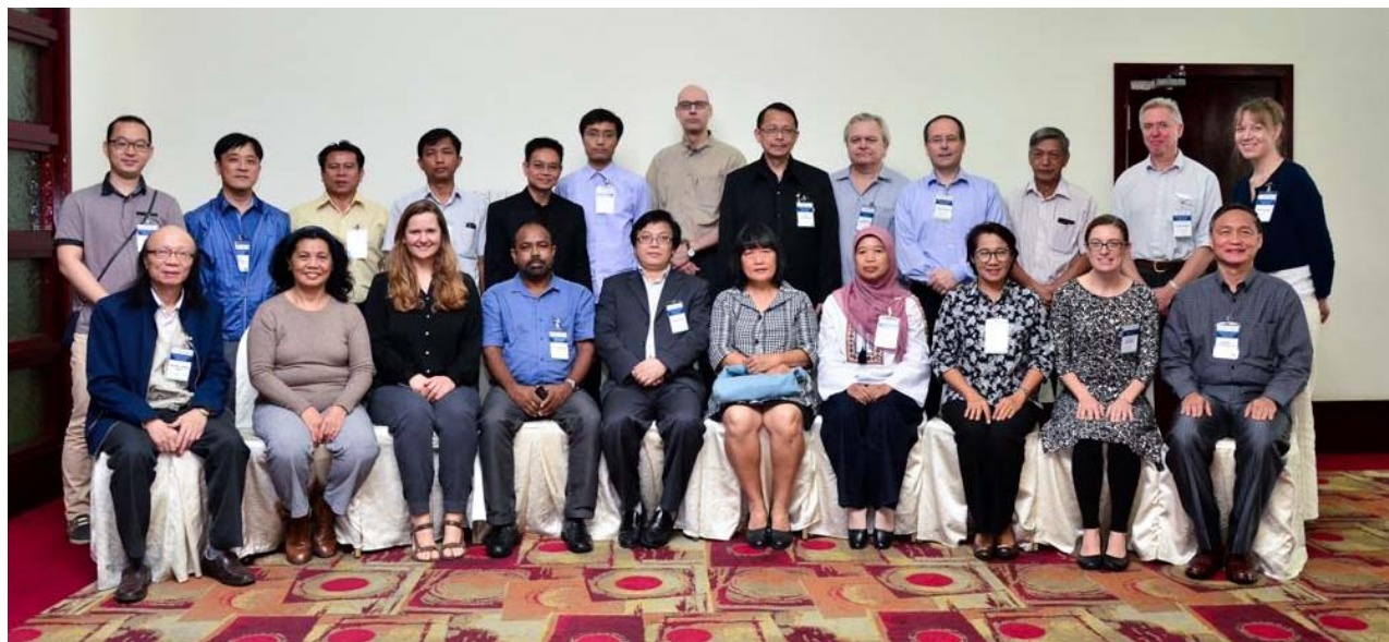
Photo: Workshop on regional project development, Kuala Lumpur, March 2017

APFORGEN cordially invites countries and institutions in the region, the private sector, and the international community to collaborate with the network and invest human and financial resources for the implementation of the Global Plan of Action on FGR in the region. Forestry authorities, national and regional research organisations in the Asia-Pacific region are welcome to join as network members.