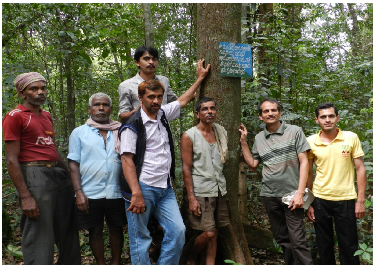
Photo: Seed tree of wild nutmeg ( Myristica malabarica ) conserved through a community initiative, Western Ghats, India

However, there is widespread lack of awareness about the importance of genetically diverse, quality seed, and lack of documented seed sources. Lack of, or poorly enforced, regulations on forest reproductive material have in many cases resulted in mass production of seedlings of unknown origin and quality, often with narrow genetic base, and in their uncontrolled transfer within and across national borders. The potential of natural regeneration as a restoration method is not fully recognised, however, it, too, depends on the availability of adequately diverse seed sources.