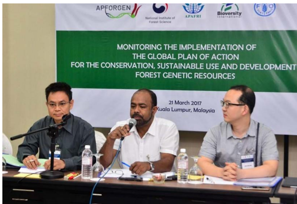
Photo: APFORGEN's Strategy Week, Kuala Lumpur, March 2017