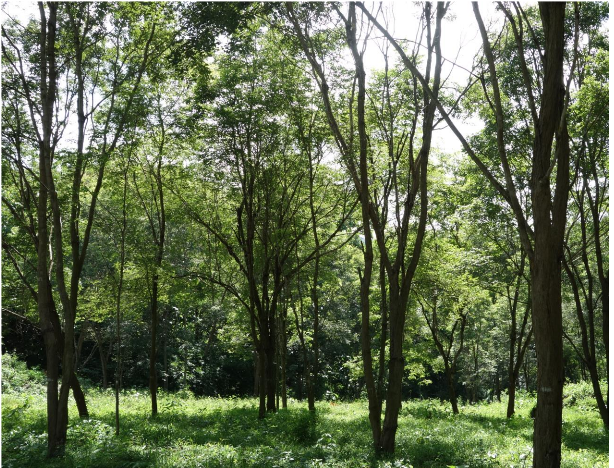
Photo: Seed production area for Siamese Rosewood ( Dalbergia cochinchinensis ), Thailand

Recognizing these threats, the Convention on International Trade on Endangered Species (CITES) in 2016 placed trade restrictions on the entire genus of Dalbergia . Endangered Shorea species on the IUCN Red List of Threatened Species include, among many others, S. leprosula , S. lamellata , S. lumutensis , S. hemsleyana