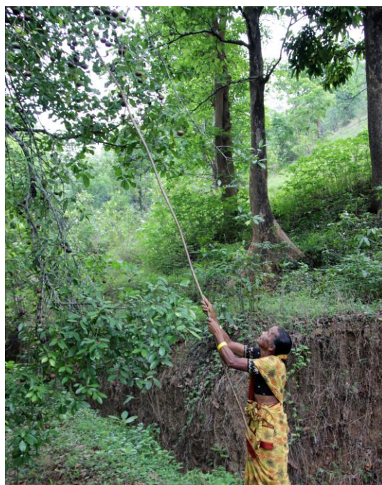
Photo: Woman harvesting Indian Gamboge ( Garcinia indica ) in Western Ghats

According to the first-ever report on the State of the World's Forest Genetic Resources, more than a thousand tree species in Asia and the Pacific are actively managed, for diverse purposes such as timber, non-timber forest products, energy and other ecosystem services – a reflection of the enormous ecological and cultural diversity of the region. Yet, the region also has more threatened tree species than any other part of the world, numbering more than 1700, according to the same report 1 . The high prevalence of endemism in Asia and the Pacific makes tree species extremely vulnerable to habitat degradation. This, in turn, undermines their ability to provide food, other goods and ecosystem services for the region's 4.5 billion people and rapidly growing economies.