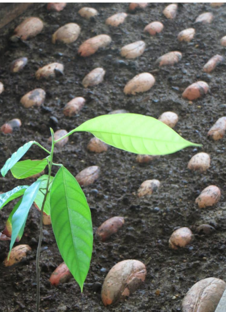
Photo: Borneo Ironwood ( Eusideroxylon zwageri ) grows in a nursery

Discontinued government and donor support for national tree seed supply systems and the prevalence of tree farms by small-holders in the region justify the development of market- or demand-driven decentralized seed supply systems. Decentralized seed supply systems can both help meet the demand for seed and provide income for local communities, and there are already promising models in the region that could be tested and adapted in other countries.