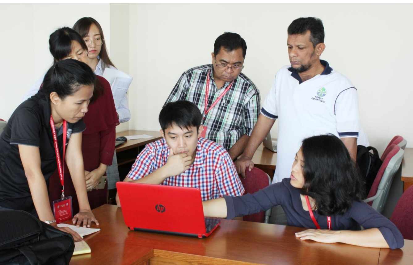
Photo: Participants working on a case study at the Regional Training Course on forest genetic resources, Binzhou, China, October 2017